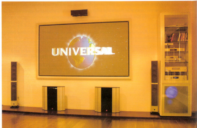
The Sound Room Design-self explanatory!